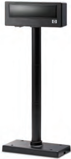
HP Point of Sale Pole Display

A high performance point of sale display that works in your point of sale environment to keep your customers informed.