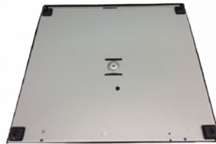
Anti-tilting safety feature