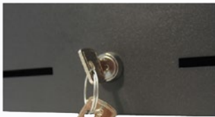
Three function cam-lock