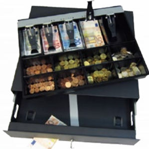
8 Coin, 5 note insert