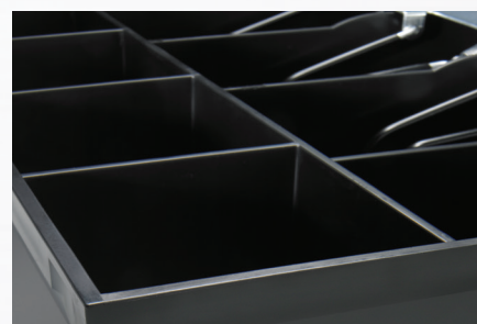
Heavy Duty Till Equipped with strong dividers and comfort coated holdowns.