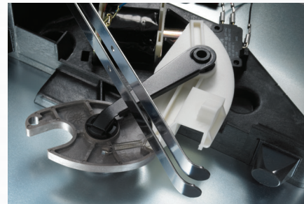
Heavy Duty Latch Mechanism A perfect balance between ease of operation and robust construction.