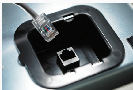
MultiPRO® Interface The MultiPRO interface adapts to most POS platforms.